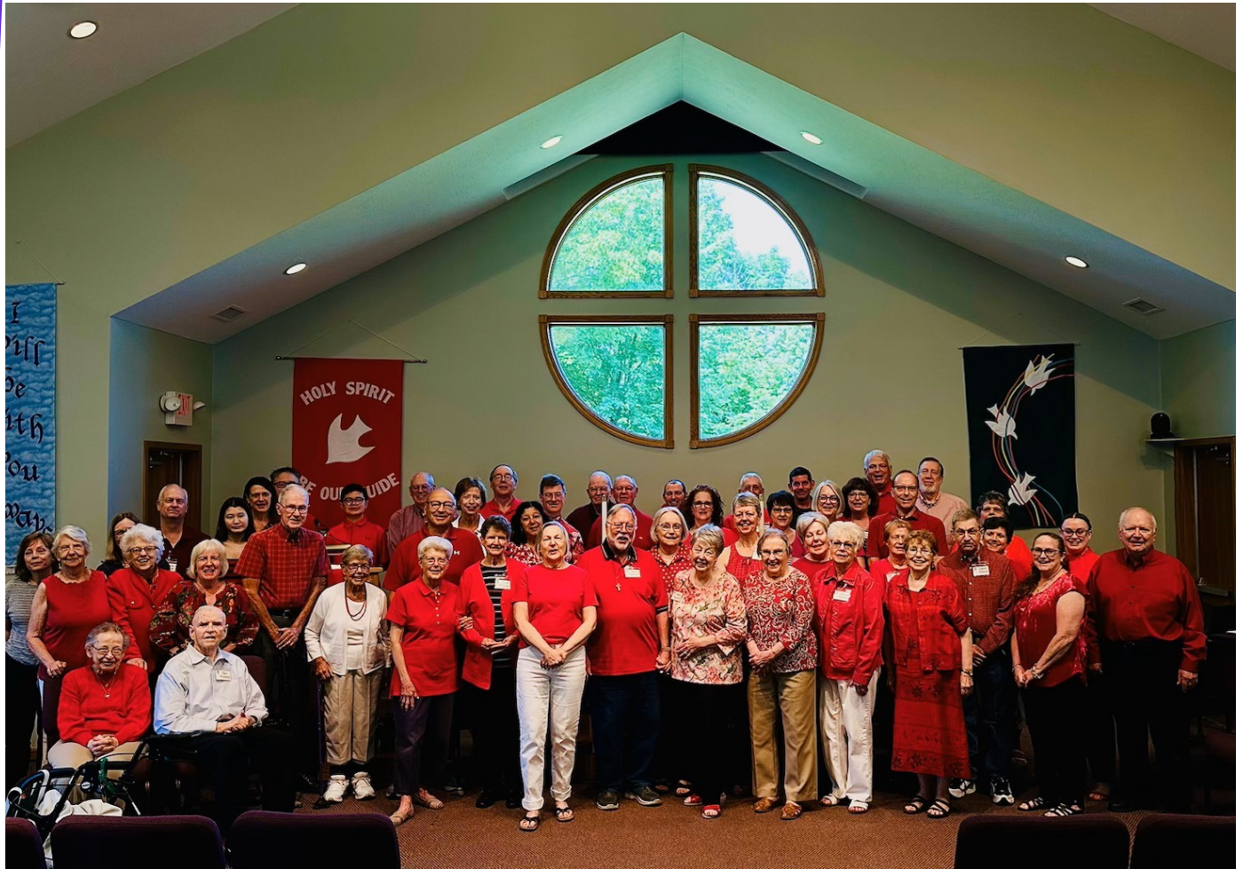
Pentecost Sunday Group photo—May 19, 2024