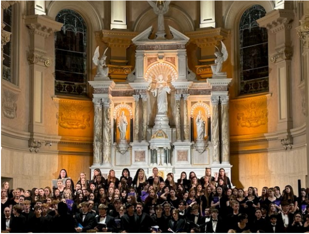
Above: Hudson and Brecksville HS choirs, combined