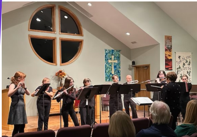
Flute Concert, Oct 29, 2024