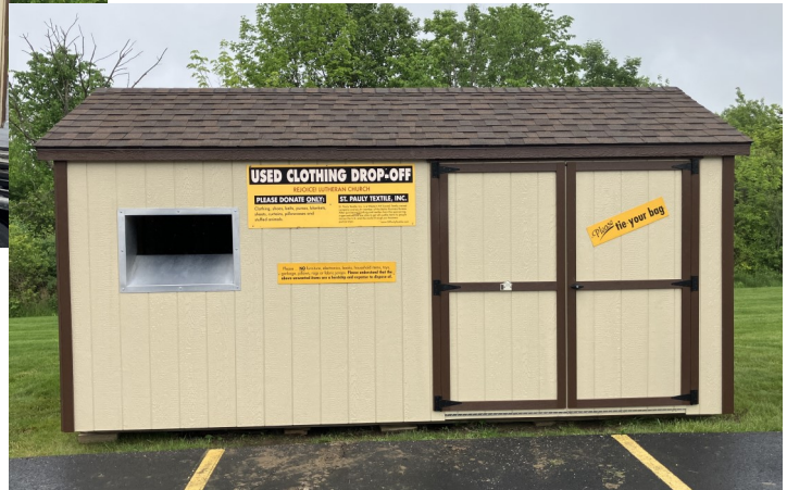
New shed in its place