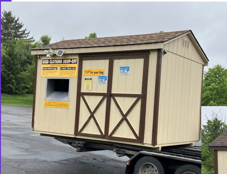
Old shed being hauled away